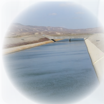
Sacramento-San Joaquin Delta via the 444-mile California Aqueduct

Vallecitos customers receive 100 percent imported water from SDCWA, which is purchased from MWD. Water is mainly imported from: