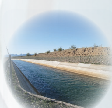
Colorado River via the 242-mile Colorado River Aqueduct

During its journey, your water remains safe due to increased security at key facilities, increased water sampling, and aerial and ground patrols. Protecting your water doesn't end with the thousands of tests performed throughout the year. Vallecitos also supports regulatory changes in public policy to improve water quality.