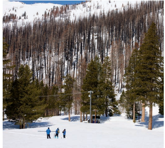
The Department of Water Resources conducts a snow survey in the Northern Sierras.