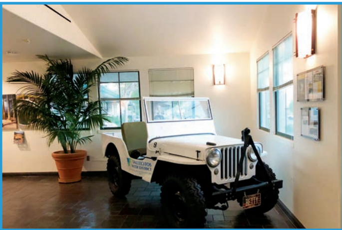
Jeep will be on display in the lobby of our Administrative Offices.