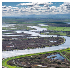
Sacramento-San Joaquin Delta via the 444-mile CA Aqueduct