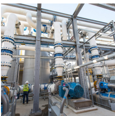
Claude "Bud" Lewis Desalination Plant in Carlsbad

The end result is more than 5 billion gallons of an exceptional product delivered annually through 19 operational storage reservoirs and 350 miles of pipeline to a 45-square-mile area that includes San Marcos; Lake San Marcos; portions of Escondido, Carlsbad, and Vista; and unincorporated areas in San Diego County.