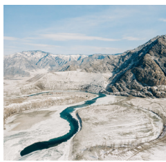
Colorado River via the 242-mile Colorado River Aqueduct