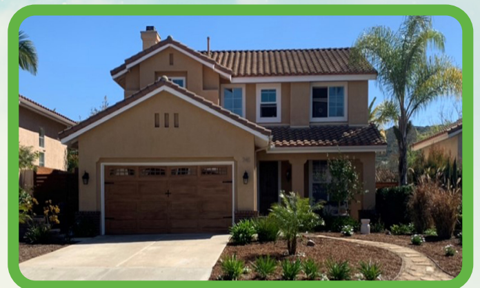
Third place winner: Ellen Kaplan