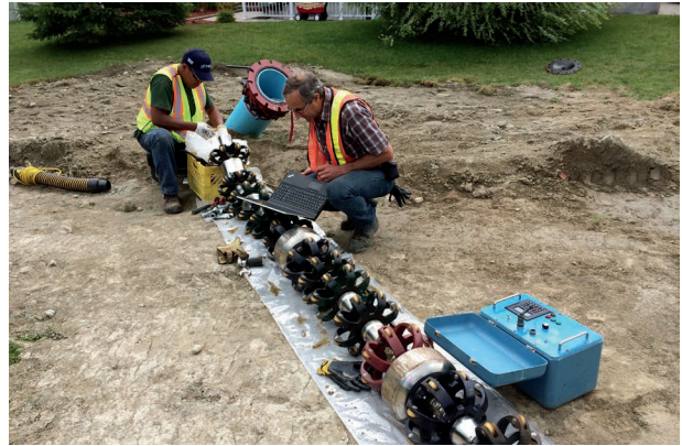
PICA Corporation's "See-Snake" tool.

Several processes were included in the High Point Pipeline Assessment project. Crews inserted a tool developed by PICA Corporation called a “See-Snake” into the pipeline, and gathered data showing the condition of the pipes. The See-Snake used an electromagnetic method on iron pipes, which can “see” past cement mortar, epoxy, or polyethylene lining to any actual damage to the iron structure of the pipe itself.