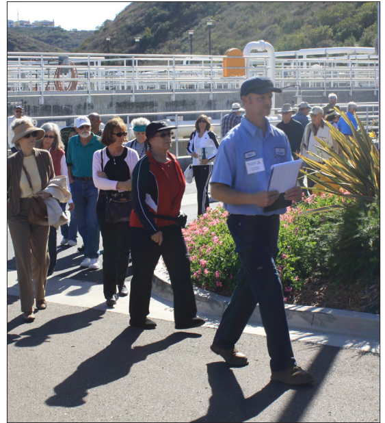
District staff takes customers on a tour of Meadowlark Reclamation Facility

In addition to these destinations, other tour highlights include seeing how specialized equipment is used in the field to keep the wastewater flowing, visiting the Water Operations Department's computerized control room to see how the District ensures that the drinking water is safe, and touring the Sustainable Demonstration Garden where participants will learn easy steps to conserve water. Various presentations will also be given at the beginning of the tour where participants