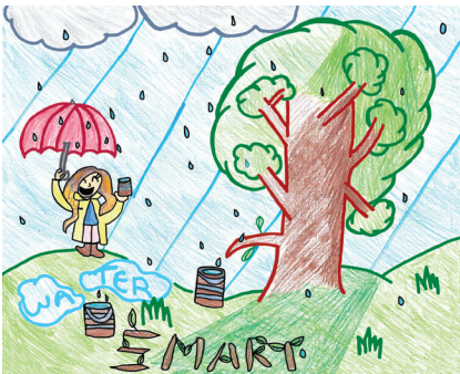
First Place: Phoebe Nuyen